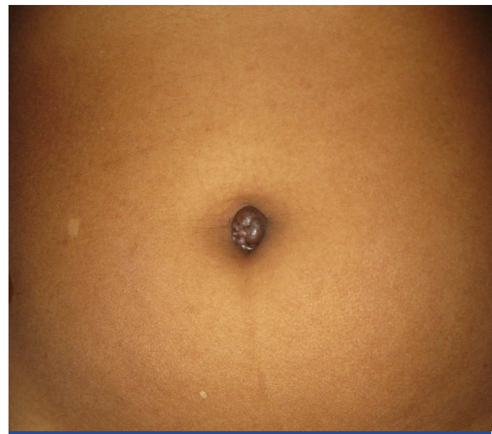
[Table/Fig-1]: Dark brown, painless umbilical nodule

found in the pelvis, which include the ovaries, the peritoneum, the uterosacral ligaments, the pouch of Douglas, and the rectovaginal septum, but they may also rarely occur in extra pelvic locations. These include most of the body cavities, as well as organs which